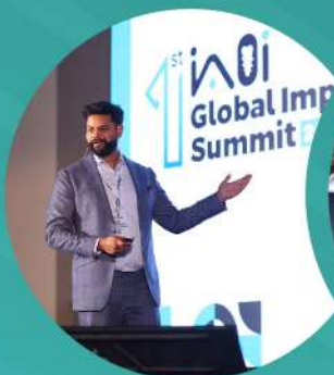
E POSTER PRESENTATIONS