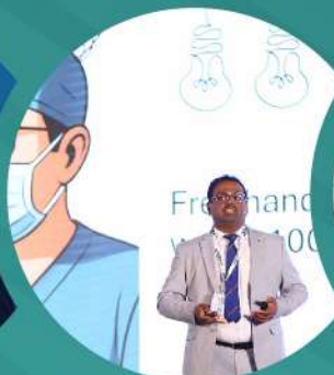
PRE CONFERENCE COURSE