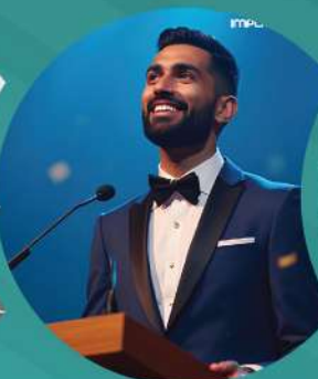
YOUNG IMPLANTOLOGIST FORUM