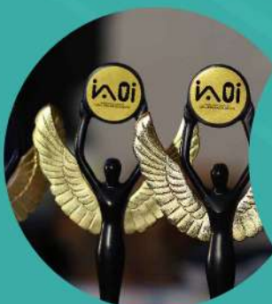
IAOI AWARDS OF EXCELLENCE