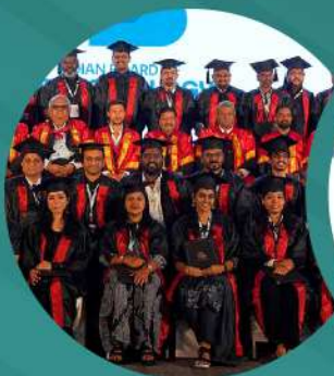
FELLOWSHIP AND DIPLOMATE AWARDS