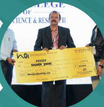
IMPLANT SHARK TANK