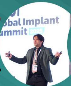
THEME BASED LECTURES